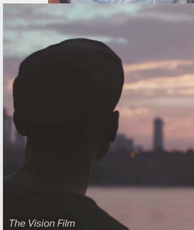
The Vision Film