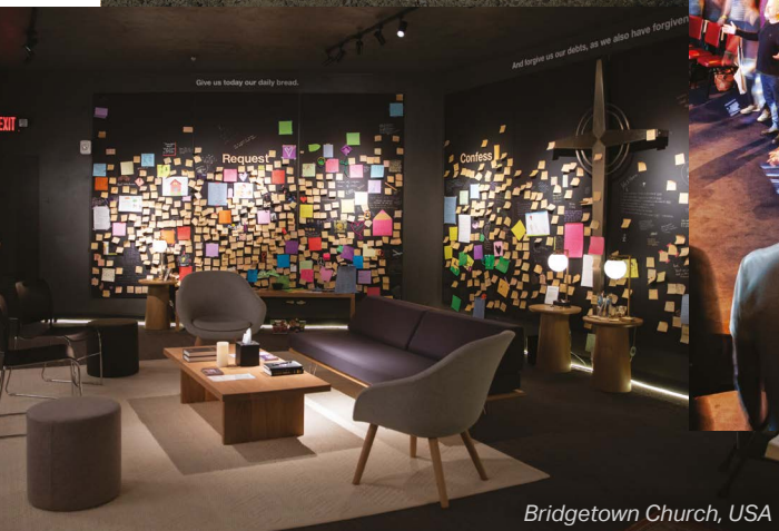
Bridgetown Church, USA