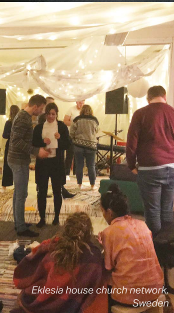
Eklesia house church network, Sweden

This gives you access to our online Sign-up Tool, which makes it easy to coordinate community prayer slots and run your Prayer Room yourself.