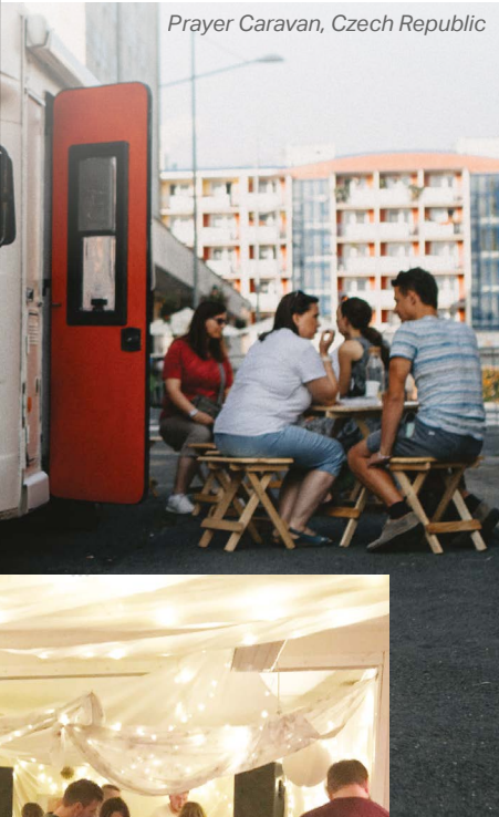
Prayer Caravan, Czech Republic

We believe that there is significance in devoting a specific time in a specific place to pray; stepping out of your normal routine to make a physical journey – a pilgrimage – to a dedicated place of prayer.