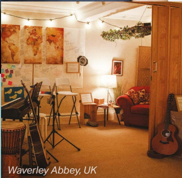
Waverley Abbey, UK