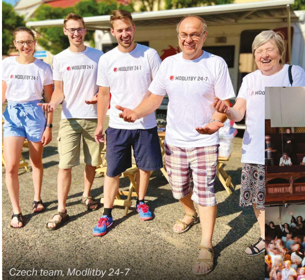
Czech team, Modlitby 24-7