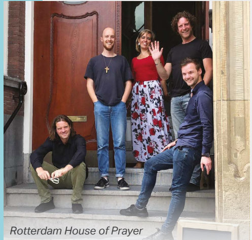
Rotterdam House of Prayer

This completely depends on the size of your community and their hunger for prayer. Remember – build momentum! You want your prayer room to last a length of time that's stretching but is also achievable.